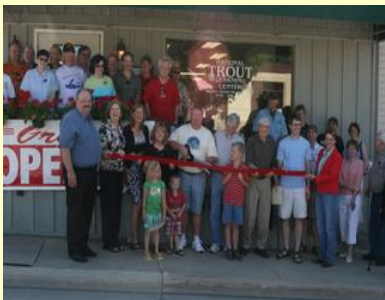
NTLC at the Grand Opening.

At the trout center we are very pleased with the outcome of the season and want to keep the activity level high, so the center plans to have a winter workshop series starting in November. For more information please read “Winter Workshop Series” in this newsletter.